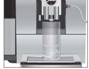
Latte Macchiato / Cappuccino/ Flat white / Espresso Macchiato

Select Coffee by pressing the Rotary Switch / Start Menu