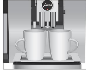
2 Ristretti /2 Espresso 2 Black Coffees (press coffee twice within 2sec.)